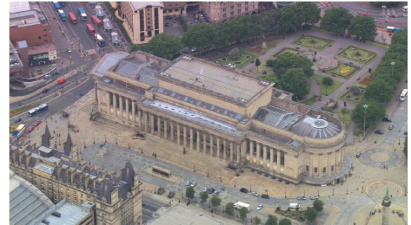
St George's Hall