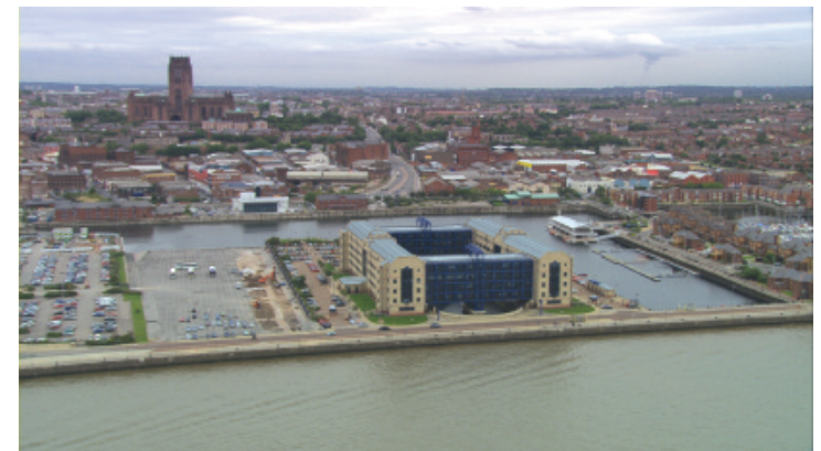
The headquarters of HM Customs and Excise and VAT at Queen's Dock