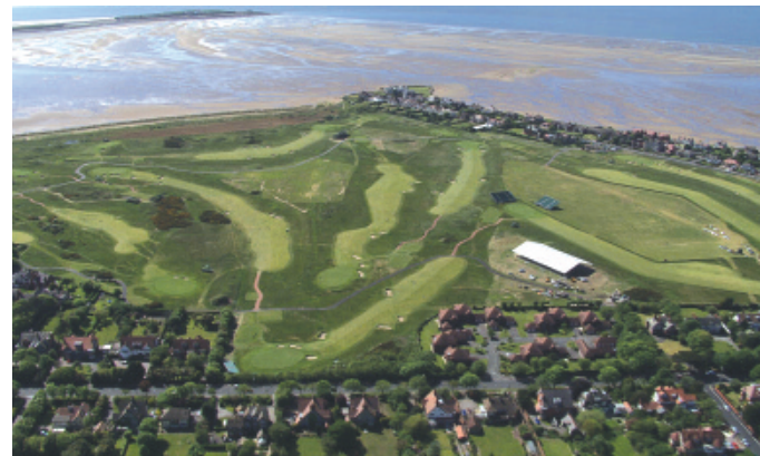
The morning sun on the Royal Liverpool Golf Course