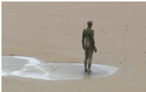
One of the figures in Antony Gormley's sculpture Another Place on Crosby Beach.