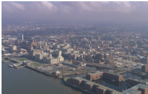
High over the Waterfront.